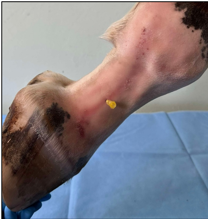
The needle is directed along the palmar/plantar aspect of the bone.