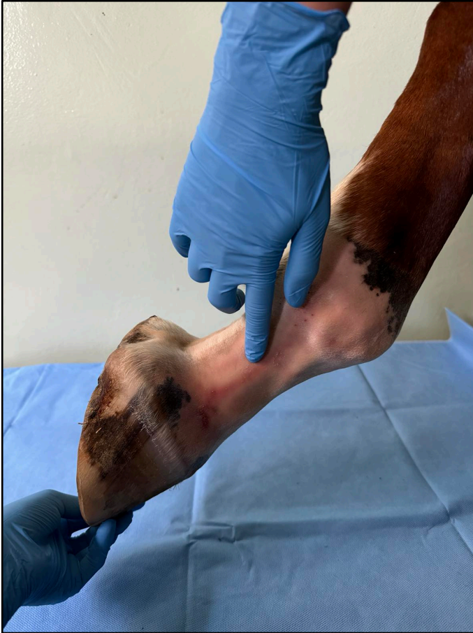
The injection site is at the palmar/plantar aspect of the bone, where is the V-depression formed.