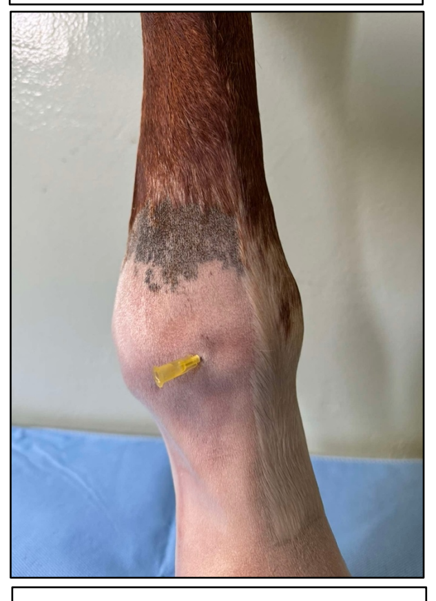
The needle in place.